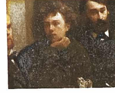
1874 French symbolist poet Arthur Rimbaud becomes famous before the age of 20. He subsequently drops out, enlists in the Dutch army, becomes a quarry foreman in Cyprus, and ends up as a coffee exporter and alleged white slave trader in Somalia.