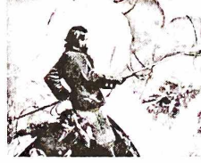
1819 Herman Melville is born. He writes "Bartleby the Scrivener," as an early treatment of office burnout and follows with Moby-Dick , a classic tale of obsession that leads to emotional and physical disaster.