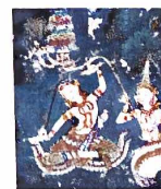
530 BCE Nepalese prince Siddhartha Gautama renounces his fortune for a spiritual life; he becomes the Buddha at the age of 35.