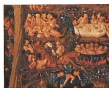
BCE Hell starts burning.