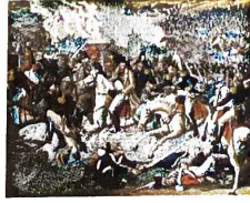
1815 Napoleon's army crashes and burns at Waterloo; he abdicates and is banished to live out the rest of his years on a small island in the Atlantic.