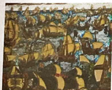
1588 Having started down the road to ruin in 1492 with the expulsion of Jews and Muslims, the intellectual lifeblood of the culture, Spain expires as an empire in 1588 with the defeat of the Spanish Armada.