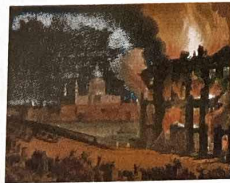
1666 The Great Fire of London, accidentally started by King Charles II's baker forgetting to douse the fire in his oven, destroys much of the medieval city within five days.