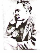
1890 German philosopher Friedrich Nietzsche has a nervous breakdown and goes insane after declaring that "God is dead."