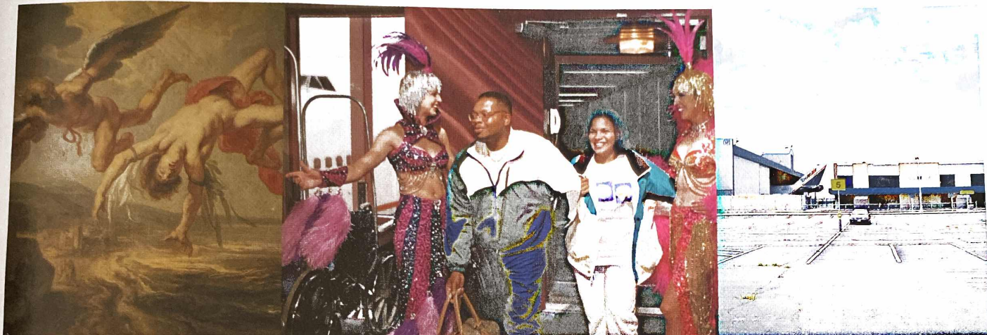
Air travel, long ago: In the joyous but overambitious first human attempt at flight, Icarus flies too near to the sun and his wings melt, causing him to plunge back to Earth. Opening day at Tower Air, 1983: happy customers, glamour girls, and champagne. Today at Tower Air: silence and a lot of parking space. Tower Air, 1983–2000. B'bye, over and out.